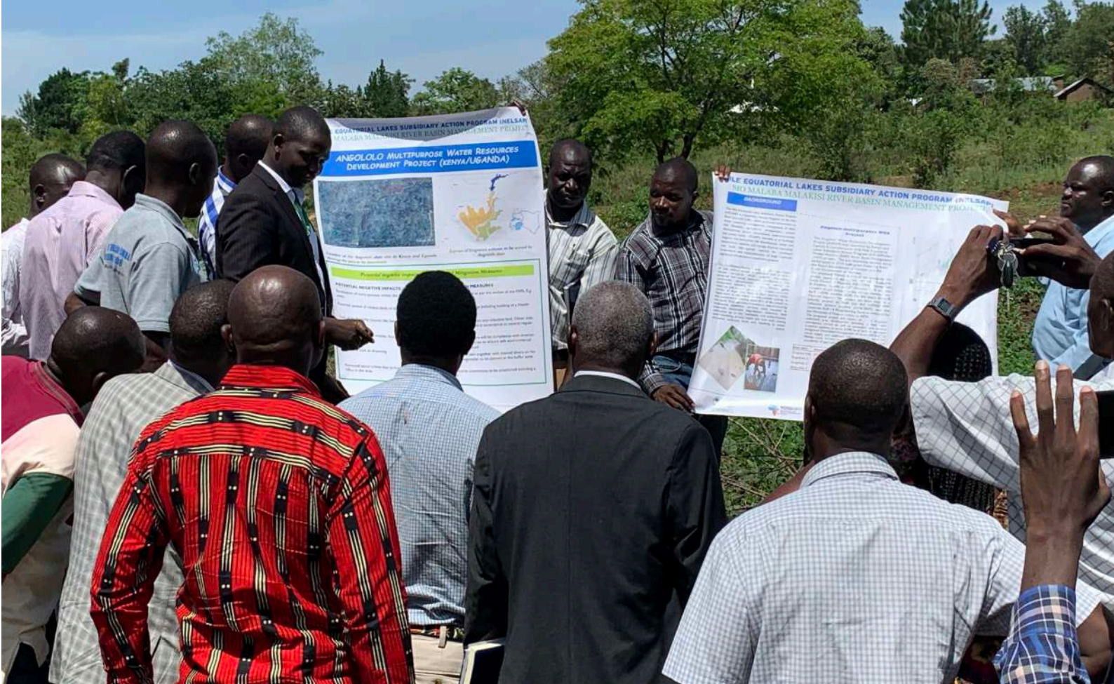
NELSAP AND REPRESENTATIVES OF KENYA AND UGANDA CONDUCTING COMMUNITY SENSITIZATION AND AWARENESS IN BOTH KENYA AND UGANDA. THIS EXERCISE WAS GRACED BY THE GOVERNOR OF BUSIA COUNTY HON. SOSPETER OJJAAMONG AND THE DIRECTOR OF TRANSBOUNDARY WATER AFFAIRS OF KENYA MS. GLADYS WEKESA AS WELL AS THE DISTRICT COMMISSIONER OF NAMISINDWA DISTRICT OF UGANDA MR. KIGAI MOSES.