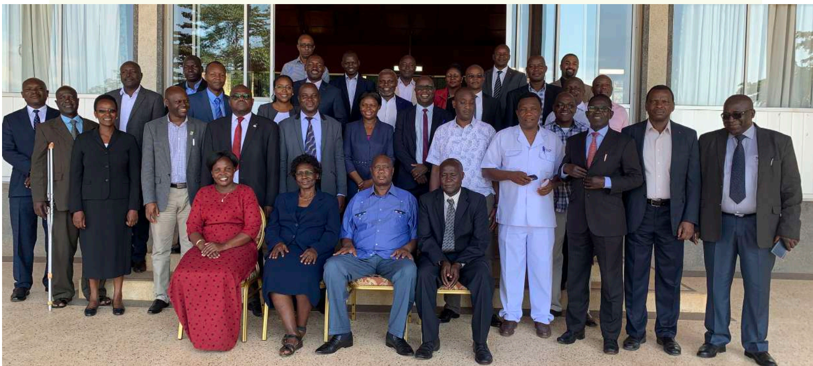
THE GOVERNOR OF BUSIA COUNTY (KENYA) HON. SOSPETER OJAAOMONG & THE DIRECTOR OF WATER RESOURCES OF UGANDA MS FLORENCE ADONGO (FRONT SEATED) DURING THE LAUNCH OF ANGOLOLO WATER RESOURCES PROJECT